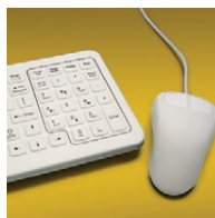
Infection Control Peripherals