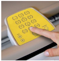
Keyless Access with Auto-Relo